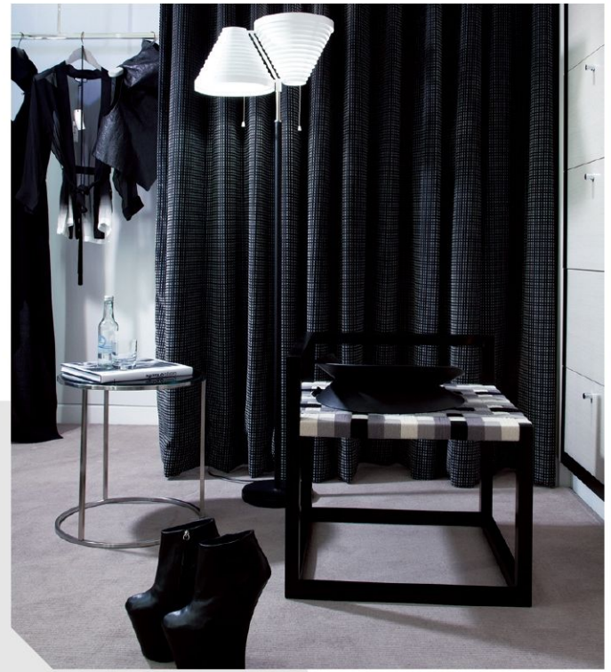
Selfridges department stores